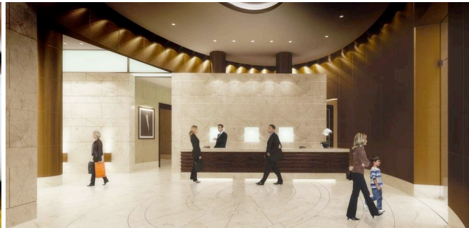
Clockwise from the top: The Rushmore's 50-foot-long indoor pool; Traveling is made easy with Luxury Attaché arrival services; The lobby of The Rushmore; Residents at TheRushmore can begin their day with LA PALESTRA fitness classes; TheRushmore's Kidville, NY-designed children's playroom.

“The opportunity for [The Rushmore’s] residents to utilize [Luxury Attaché Concierge Services] before closing on their home is a great value, and one that no other development on the Upper West Side offers.” —Melissa Ziweslin